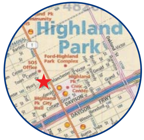
Highland Park, Michigan

Located at the northwest corner of Woodward Ave. & Manchester.